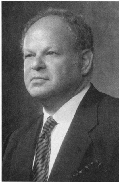
Martin E. P. Seligman